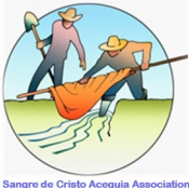
Sangre de Cristo Acequia Association