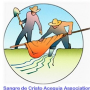
Sangre de Cristo Acequia Association