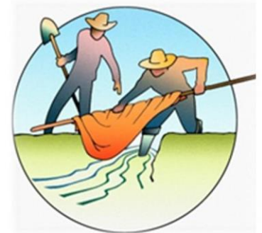
Sangre de Cristo Acequia Association